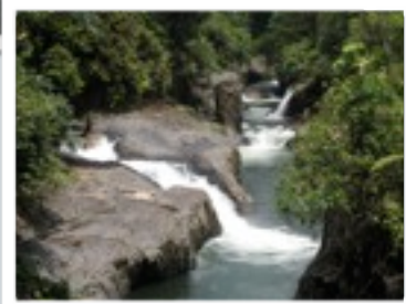
Hollín River, on route to Napo-Galeras