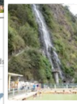
Hot springs at Baños