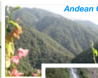
Andean Cloud forest